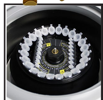
COMBI-Rotor for microtubes, PCR tubes and PCR strips!