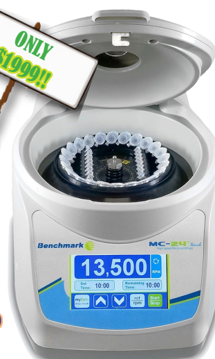
Rotor lid included