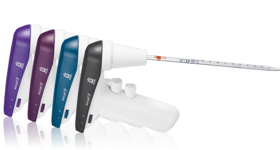
accu-jet® S Pipette Controller