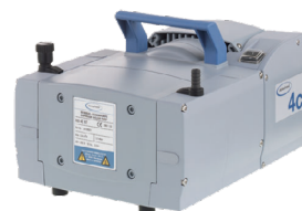
VACUUBRAND® vacuum pump or system