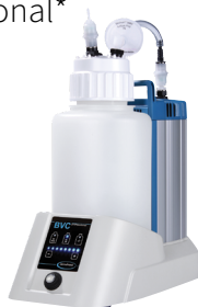
BVC Professional Fluid Aspiration System