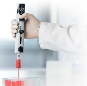
PD-Tip II Precision Dispenser tips and HandyStep® S Repeating Pipette