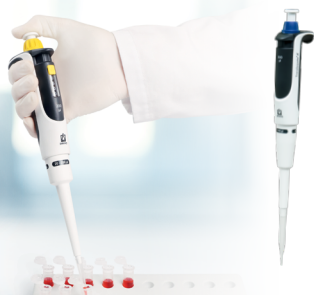
Transferpette® S Single Channel Pipette

Buy 3 BRAND® pipettes or dispensers and get a 4th of equal or lesser value for FREE.*