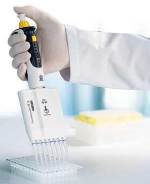
Transferpette S Multichannel Pipettes