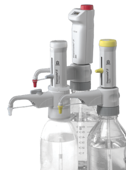
Dispensette® S Bottletop Dispenser