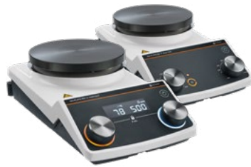
HEI-PLATE CORE AND CORE+