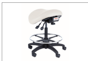
Ergolign saddle stool