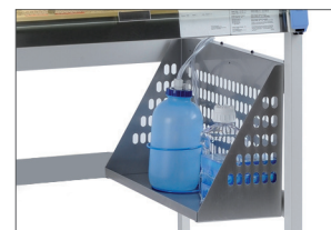
Hanging shelf for base stand

Learn more at thermofisher.com/1300promo